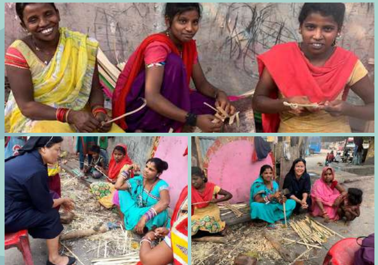
NEW AREA OF INTEREST "ECONOMIC EMPOWERMENT OF WOMEN"- SILIGURI