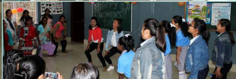
BSA BOYS & GIRLS