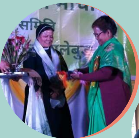
FELICITATION ON THE OCCASION OF INTERNATIONAL WOMEN'S DAY, 2020