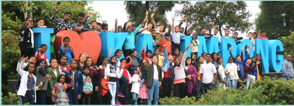
ANNUAL PICNIC AT DEOLO HEIGHTS