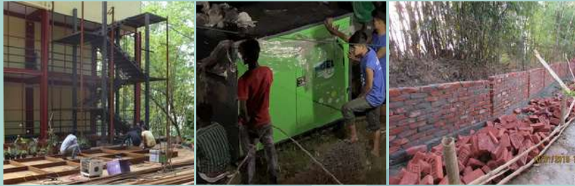
NEW GENERATOR, INNER BOUNDARY AND EMERGENCY STAIR CASE FOR BSA BOYS