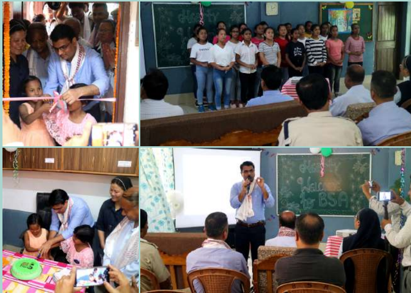
INAUGURATION OF KALIMPONG DISTRICT CHILDLINE COLLABORATIVE SERVICE 1098 BY THE DISTRICT MAGISTRATE, KALIMPONG DISTRICT

https://www.youtube.com/channel/UC6SrI5BWry2hYBdHb3zJNoA