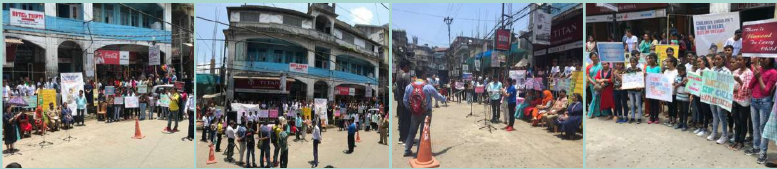
STREET PLAY- WORLD DAY AGAINST CHILD LABOUR