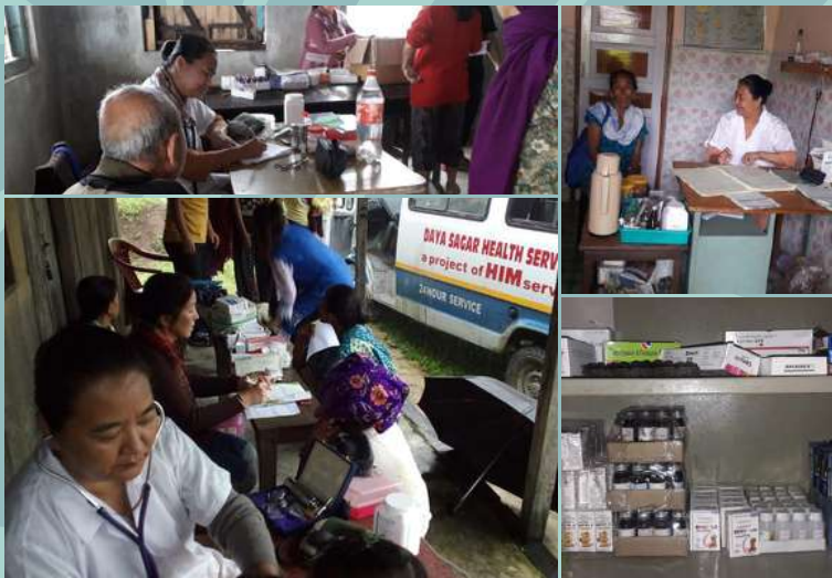
MEDICAL SUPPORT TO VILLAGE DISPENSARIES- AMTM