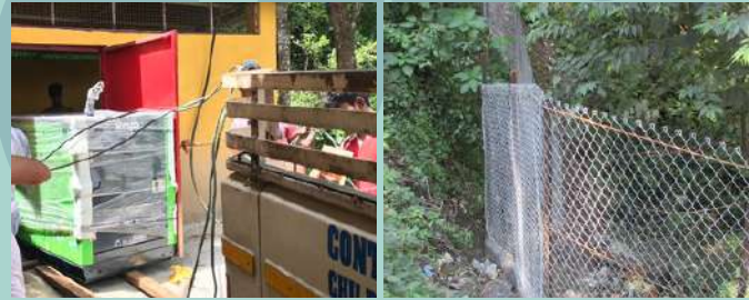
NEW GENERATOR (BSA- PUDUNG) AND OUTER FENCING/BOUNDARY OF BOYS' CAMPUS