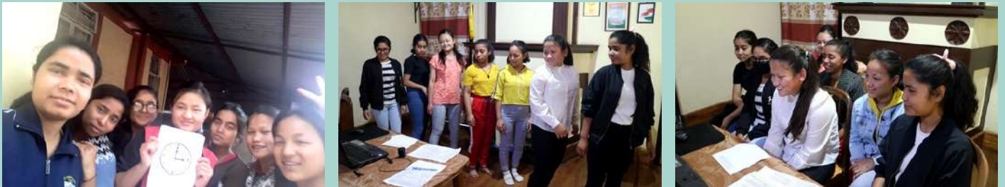
JOINED RUN WITH UNITY ON YOU TUBE DATE: MAY 3, 2020

https://www.youtube.com/channel/UC6SrI5BWry2hYBdHb3zJNoA