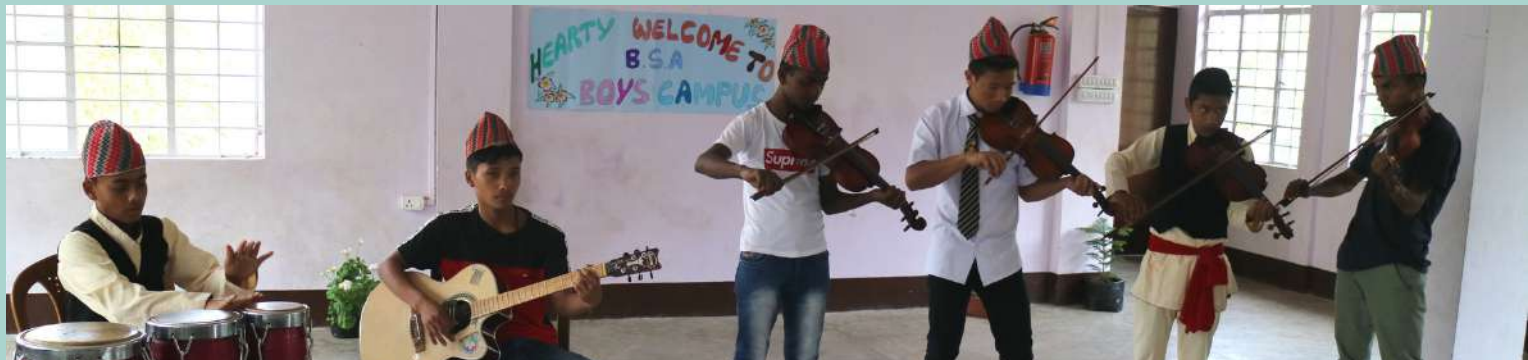
BSA CHILDREN PERFORMING FOR VISITORS